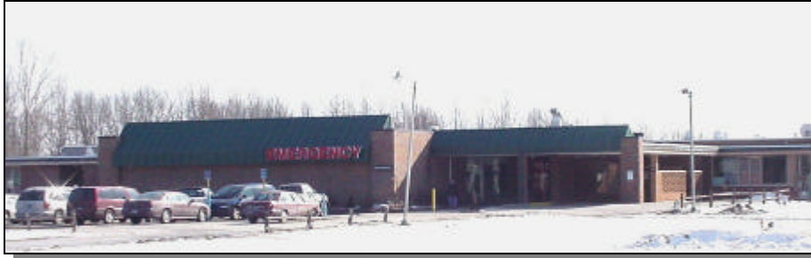
OLD HOSPITAL ENTRANCE