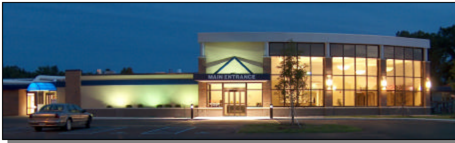
NEW HOSPITAL ENTRANCE

William A. Kibbe & Associates, Inc. provided architectural and engineering design services for additions and renovations to the existing Standish Community Hospital, creating one of the first critical care access hospitals in the State of Michigan.